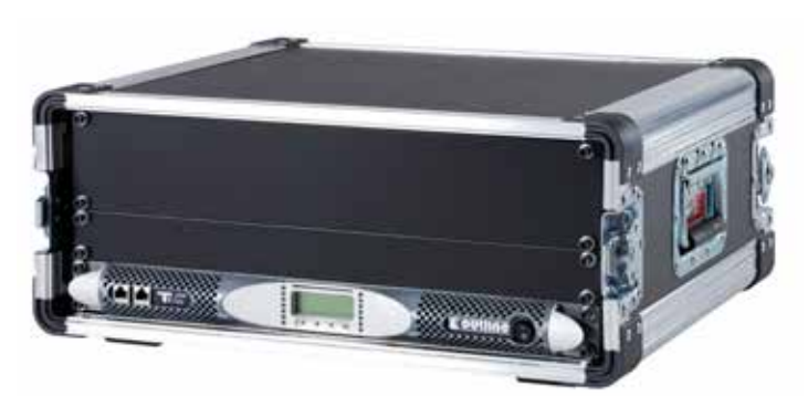
AMPRACK-EIDOS: flight-case 4Units. With front and rear removable covers including: CABLA EIDOS master INPUT panel, Mains power input box with 16 A plug and bipolar magneto-thermal switch.