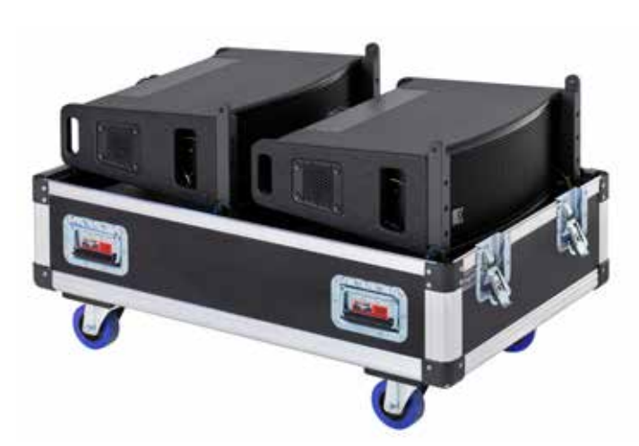
FCM 265 LA 4P: flight-case housing 4 Eidos 265 enclosures.