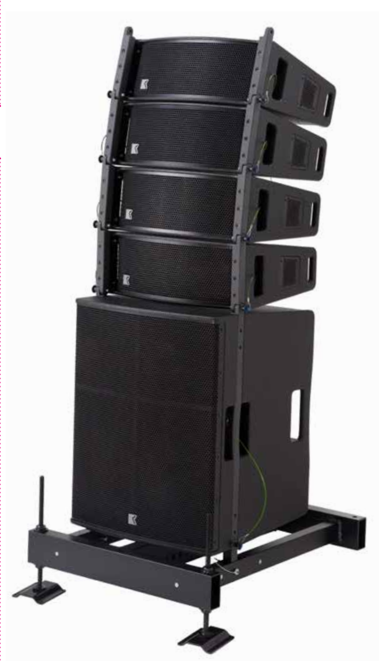
Eidos 265 + Flysub 15 stacked on Mainframe FRM-MCMPSS-L and a pair of adjustable feet. A FOOT-01

Available in RAL specified colours to suit any decor