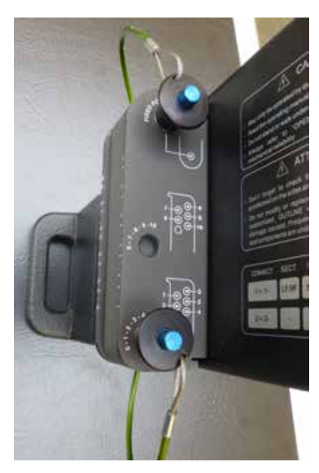
EIDOS 265 LA adjustable (up to 11 different angles) rear side rigging bar.

Eidos 265 is extremely easy to handle and equally as simple to install in a theatre or conference room, but above all, thanks to its