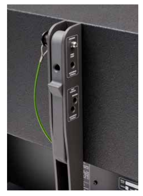
FLYSUB 15 rear side rigging bar.

factory presets, the system can be up and running in a matter of a few minutes, without any additional work. Eidos 265 is able to compete at the top end of the market category: even when compared with key competitors equipped with larger diameter transducers, Eidos 265 can easily compete and give the user amazing results from its diminutive size.